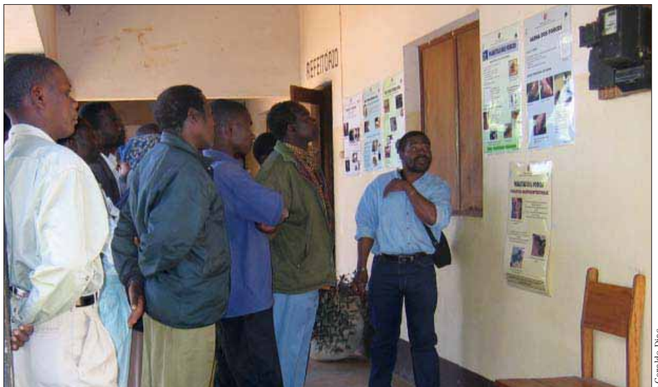
Training local health and agricultural extension workers about NZDs along with other livestock diseases and public health problems.