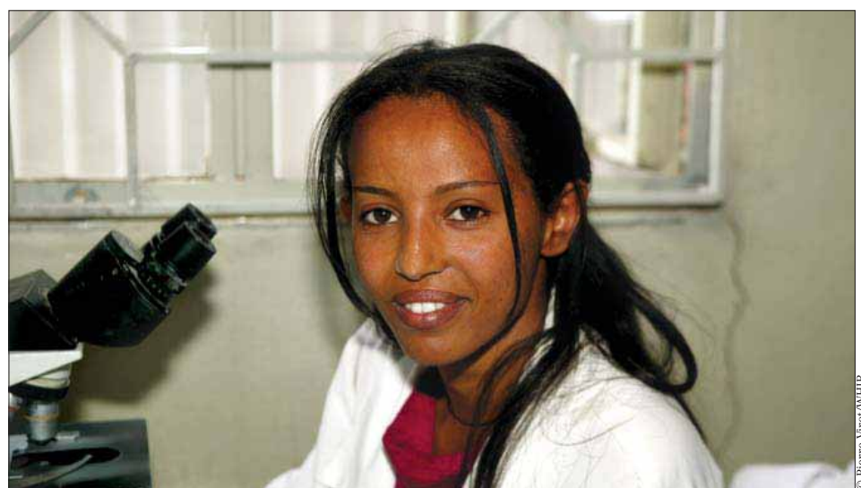
HAT control programmes have focussed on active case detection involving medical teams conducting surveys at community level.