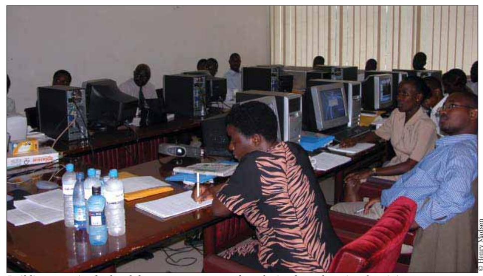
Building capacity for local data management and analysis. through regional training programmes