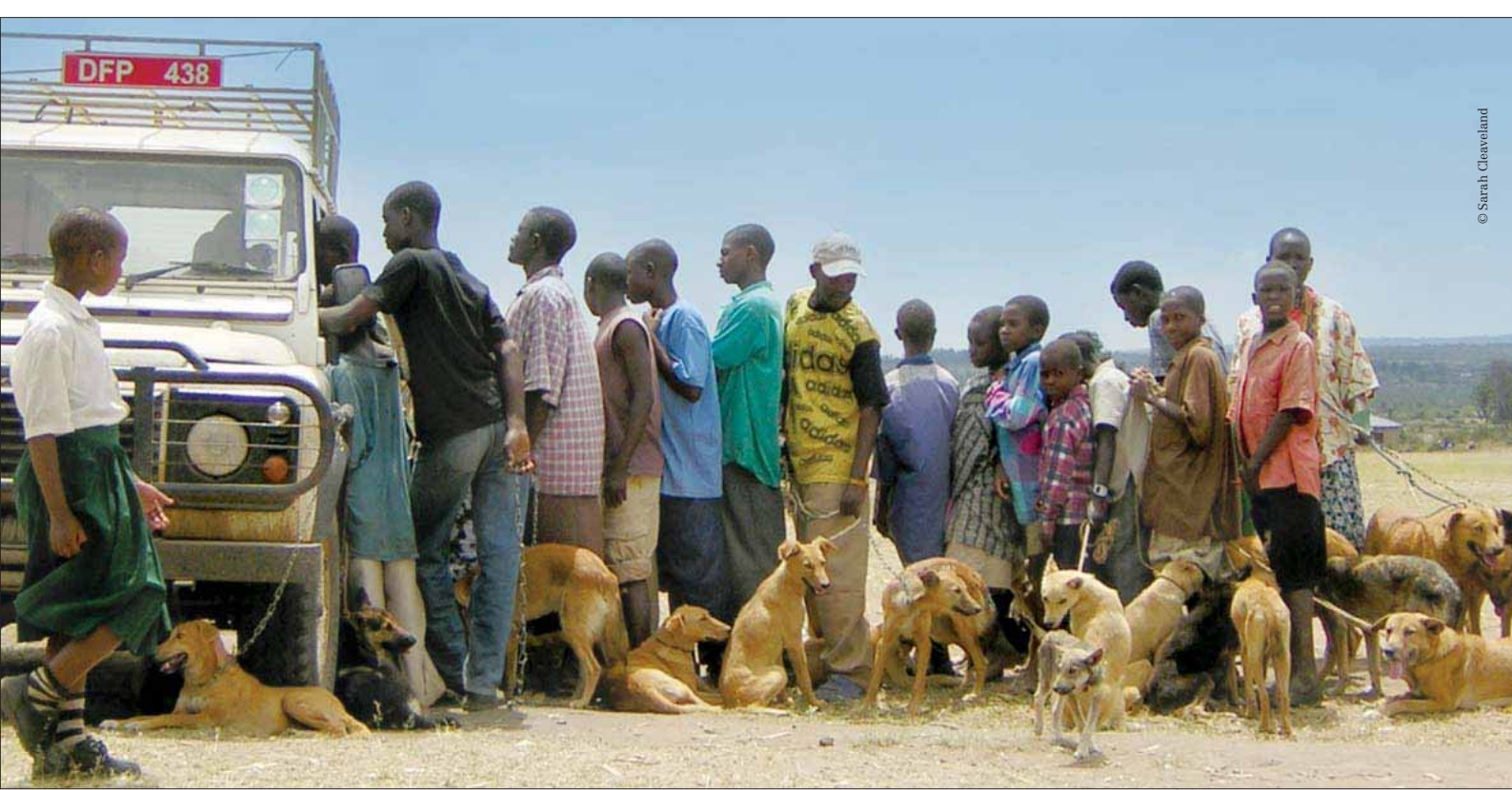
Mass vaccination campaign of dogs in Tanzania