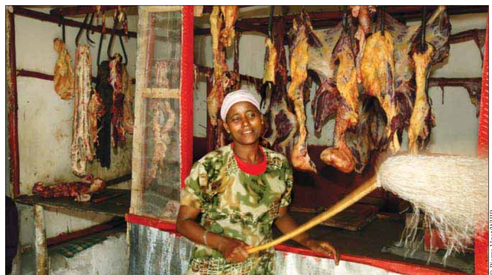
Proper meat inspection and control including responsible disposal of infected carcasses and visecera can help combat NZDs.