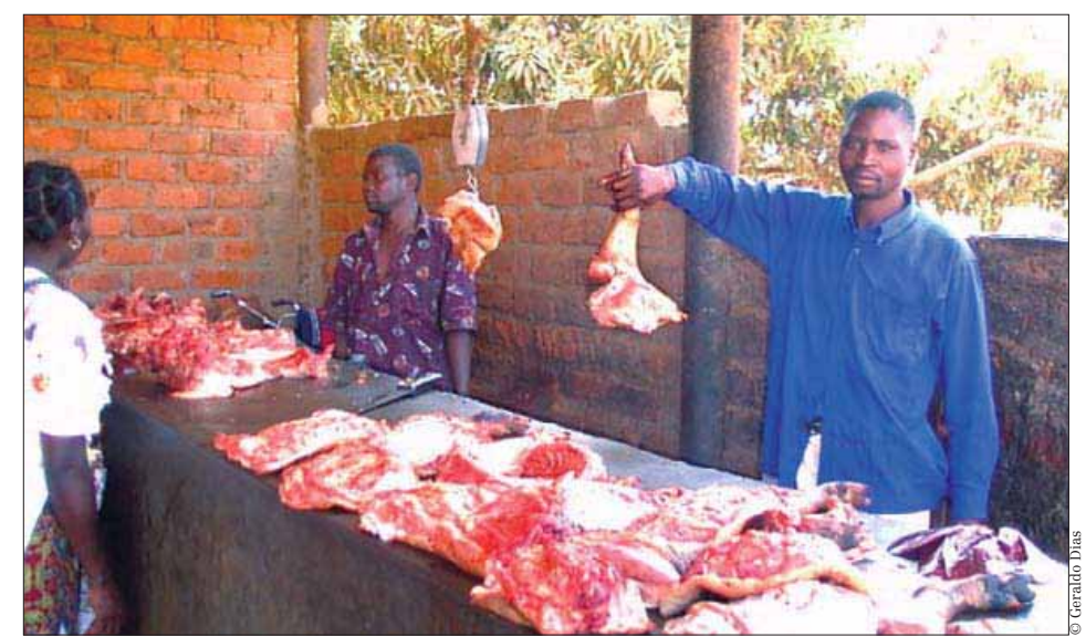
Butcher in Mozambique. Some of the NZDs are transmitted to humans through meat.