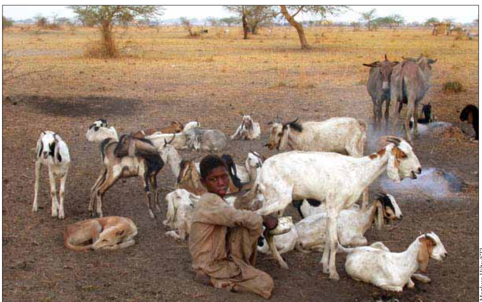
Pastoralist boy near Lake Chad. Consumption of unpasteurized milk enables transmission of NZDs from livestock to humans.